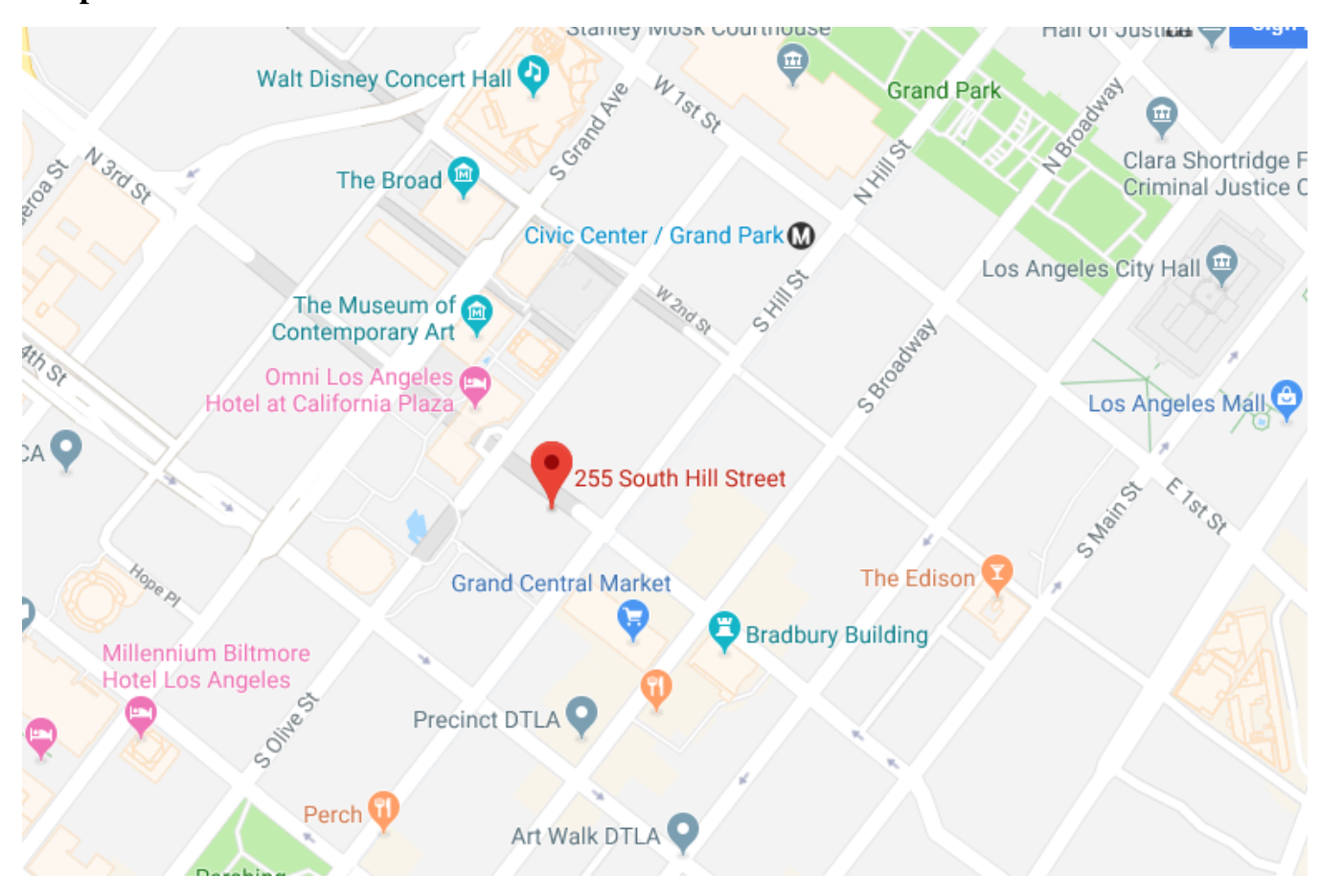
255 S. Hill St. #401. Los Angeles, CA 90012